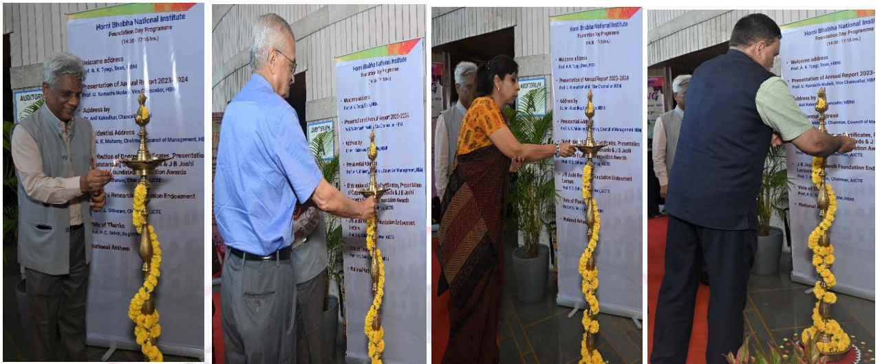
Lighting of the Lamp by the Dignitaries